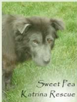
Sweet Pea Katrina Rescue

As Thanksgiving approaches, I like to reflect on all that I'm grateful for. I feel incredibly fortunate to do the work I do